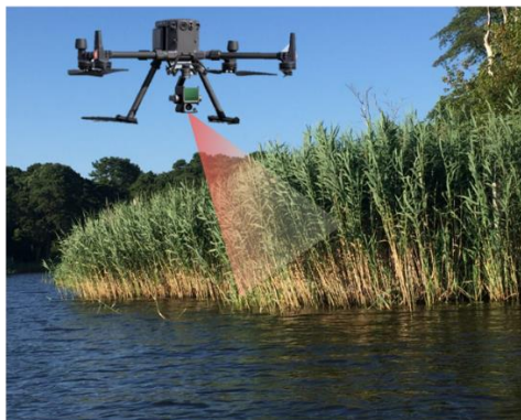
Drone with RGB-Multispectral + LiDAR sensor

We are looking for an enthusiastic graduate student to join an innovative project for Roseau Cane monitoring in the lower Mississippi River Delta. This project uses advanced remote sensing techniques to support restoration efforts. It also explores the application of machine learning for automated detection and counting of Roseau Cane Scale, an invasive species affecting P. australis , using remote imagery. By integrating remote sensing, machine learning, and entomology, the project wants to improve species management in aquatic environments. The selected student will work alongside a diverse team of experts in entomology, ecology, and remote sensing at Louisiana State University.